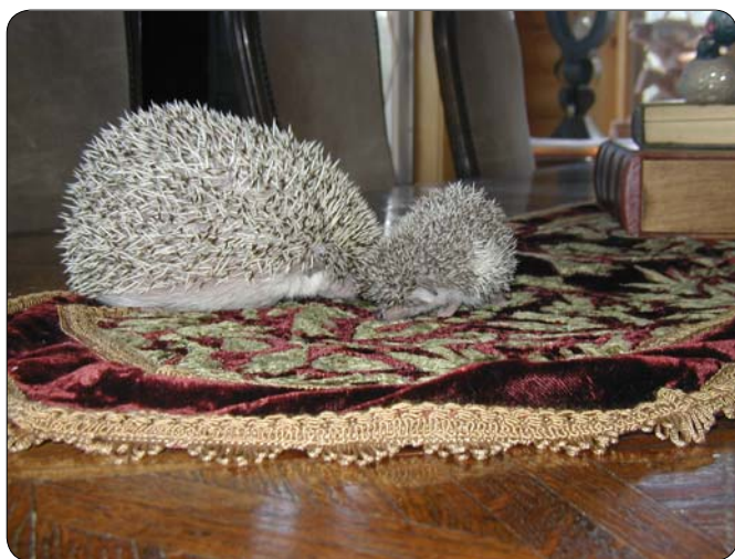
Dwarf baby hedgehog Sabinaya listens to advice from HRH Queen Sable in the Royal Hall.

Weight gains may indicate fluid retention, intestinal blockage, or fast growing tumors. Weight loss indicates that the hedgehog has gone off of her/his food and/or water. Lack of appetite may be the result of intestinal bacteria overgrowth, certain cancers, dental problems, abscesses, and a host of other ailments. Noting an exceptional weight loss is often a good early warning that something is amiss.