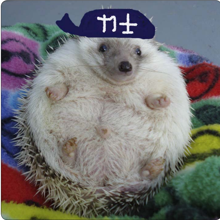
Baxtermoto

We hedgehogs are, fortunately, not so culturally limited as are our human friends. So, when one particular society treats us unkindly, we can easily embrace another that will be more benevolent, even adoring. That's what being around for some 65 million years will get you.