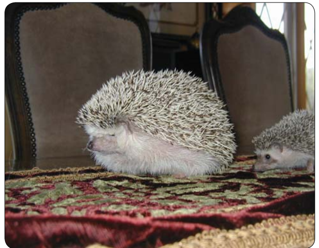
Dwarf baby hedgehog Sabinaya follows HRH Queen Sable into the Royal Hall for an audience.

HRH Queen Sable the Serene, IHR 16234 Hedgehog Monarch of North America