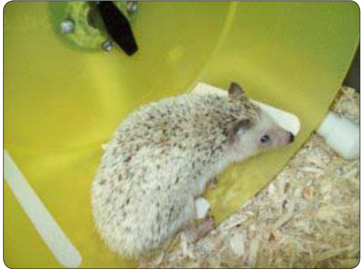
Packie Wheeling at Age Ten!