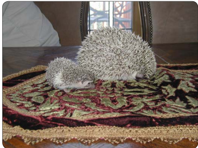
Dwarf baby hedgehog Sabinaya addresses HRH Queen Sable in the Royal Hall.